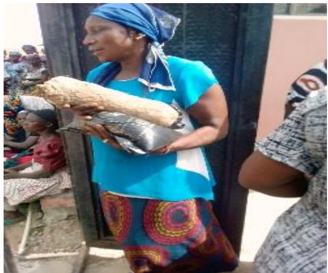
Photos from AHADEF's Feed a Household Project