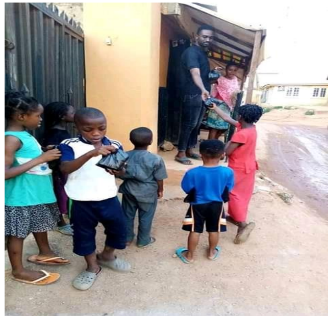
Children being handed their food packs by representative of The Paul Mission Inc.

Challenges shared by member organizations in the process of implementing food and nutrition support programmes for households within the COVID were those of difficulties experienced in moving around locations within the FCT as a result of the lockdown which made some organizations without security pass to implement their activities in neighboring communities outside of the FCT.