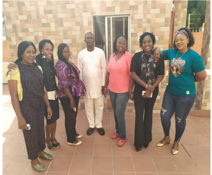
Photo showing the election process (left) and the newly constituted FCT EXCO Members