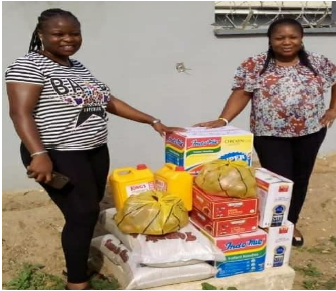
Support to Osaze We Care Foundation