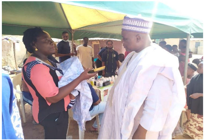
Visit to the service delivery stand by the Hakimi of Jikwoyi