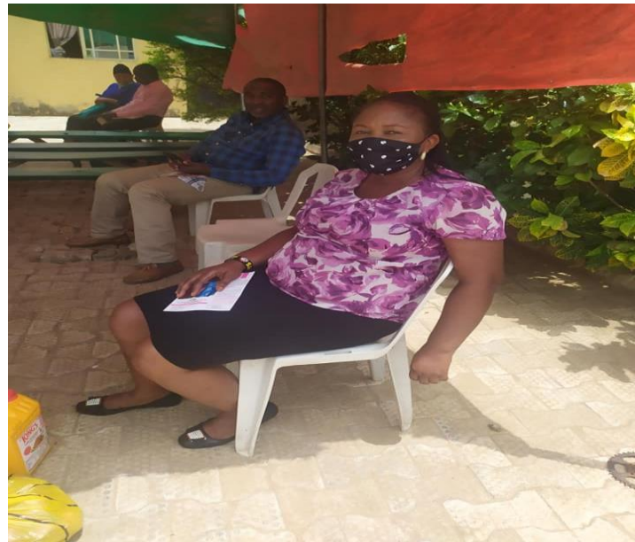
The GLI visiting team at FACADO Children's Home