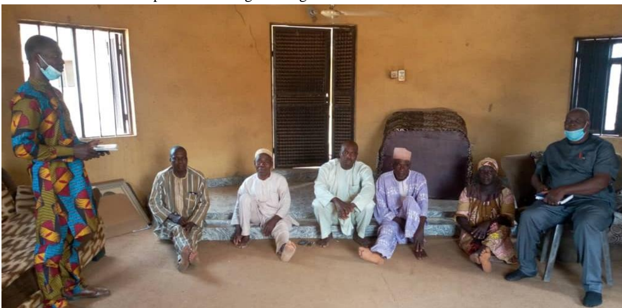
Photo from the Stakeholders' Forum