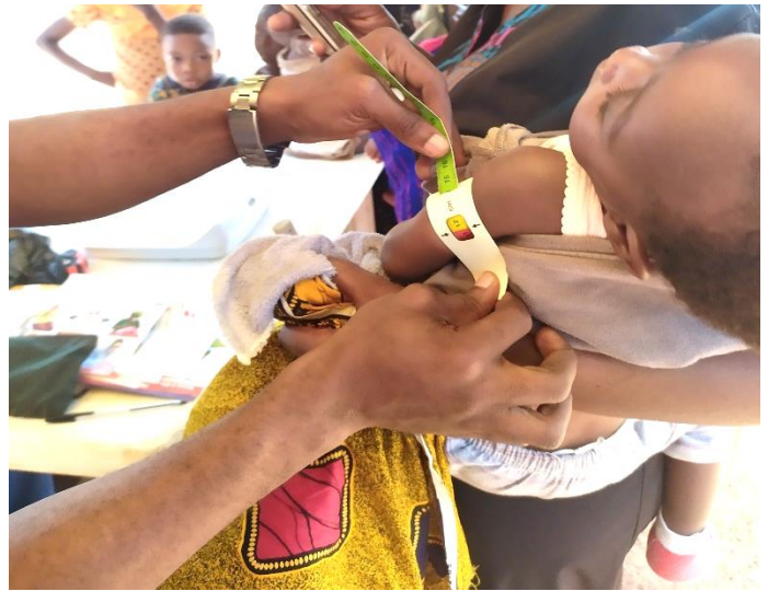
Service provision session by CS-SUNN FCT Member Organizations during the event