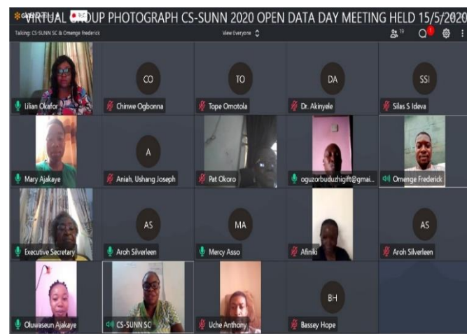
Some photos from the Open Data Event