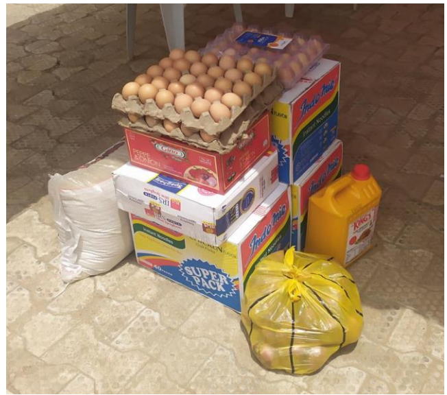
Support to FACADO Children's Home