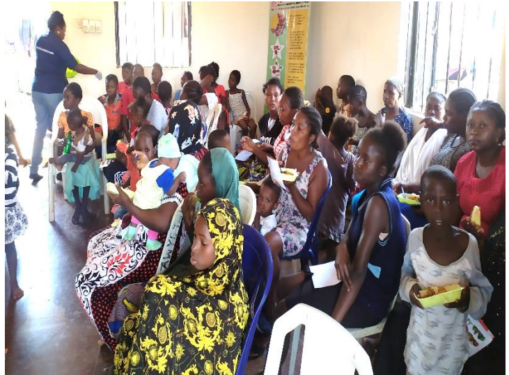
Food demonstration session (left) and consumption by mothers and their children