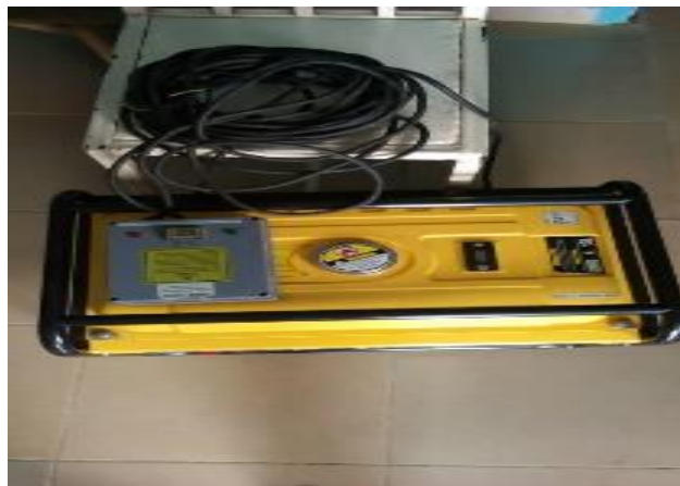
Photos showing the renovated facility and equipment provided to support its functioning