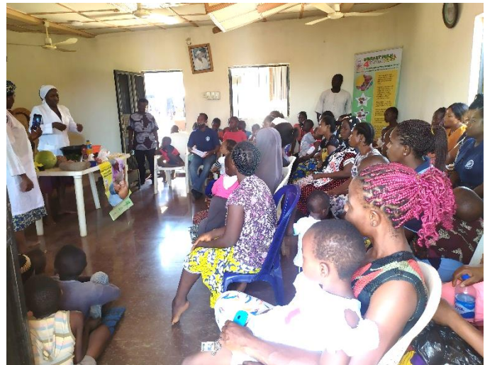
Nutrition Education for mothers at the event, anchored by CS-SUNN FCT Member - Nutrition Society of Nigeria