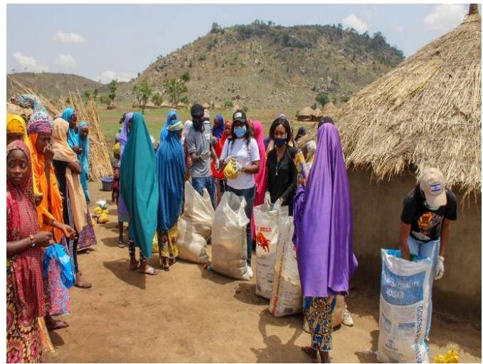
Sam Empowerment Foundation Team delivering food materials to households at Giri, FCT